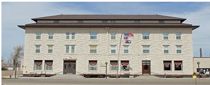
THE HISTORIC VIRGINIAN HOTEL, MEDICINE BOW