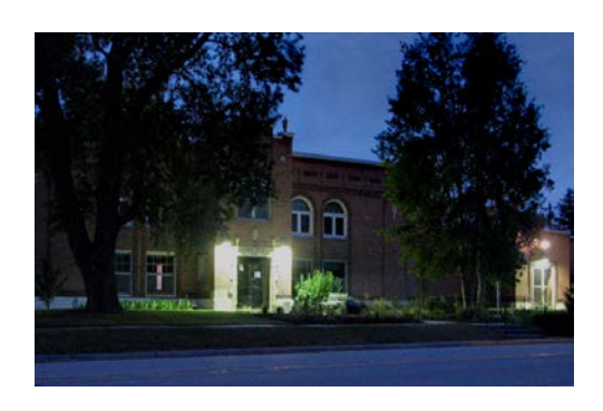
Two Colorado Towns Come Together as Colorado's First International Dark Sky Community

Tucson, Ariz., and Westcliffe/Silver Cliff, Colo. (9 March 2015) The bordering towns of Westcliffe and Silver Cliff in southern Colorado have come together to protect a shared natural resource their dark night skies. In the first effort of its kind, the towns worked side by side to ensure preservation of dark nights for the benefit of future residents. As a result of their efforts, the towns have earned Colorado's first International Dark Sky Community designation from the International Dark-Sky Association.